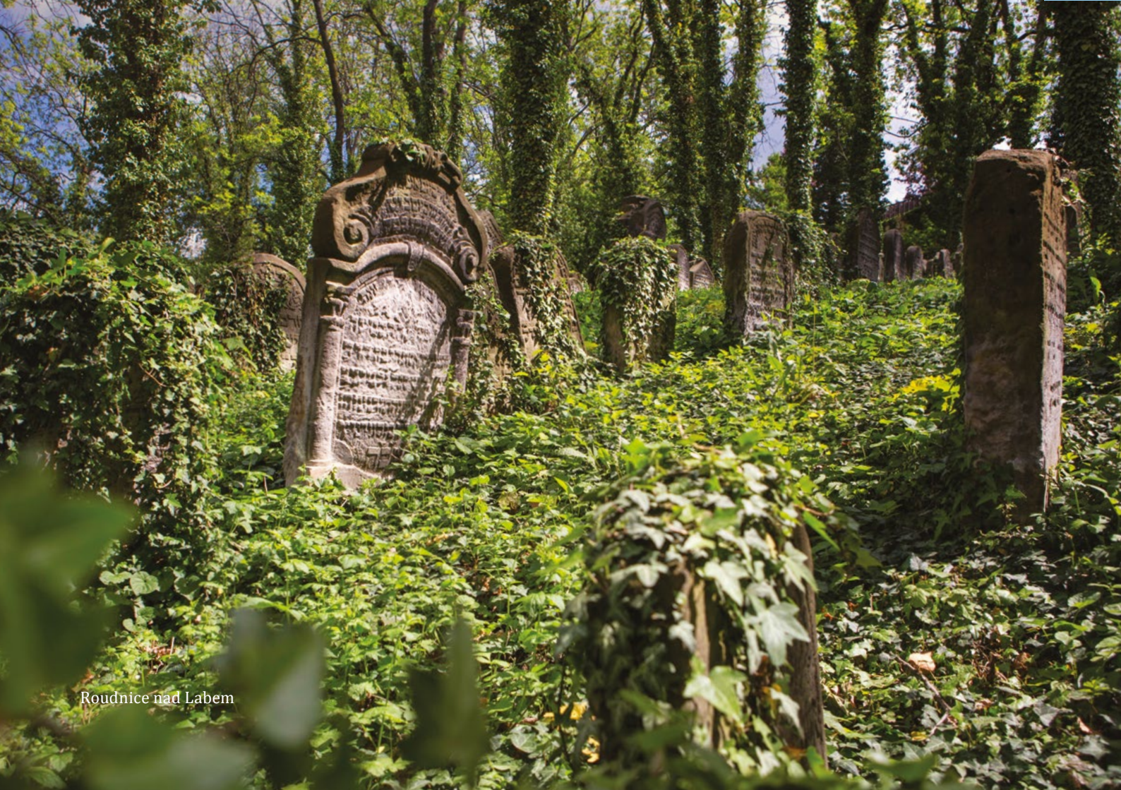
Roudnice nad Labem