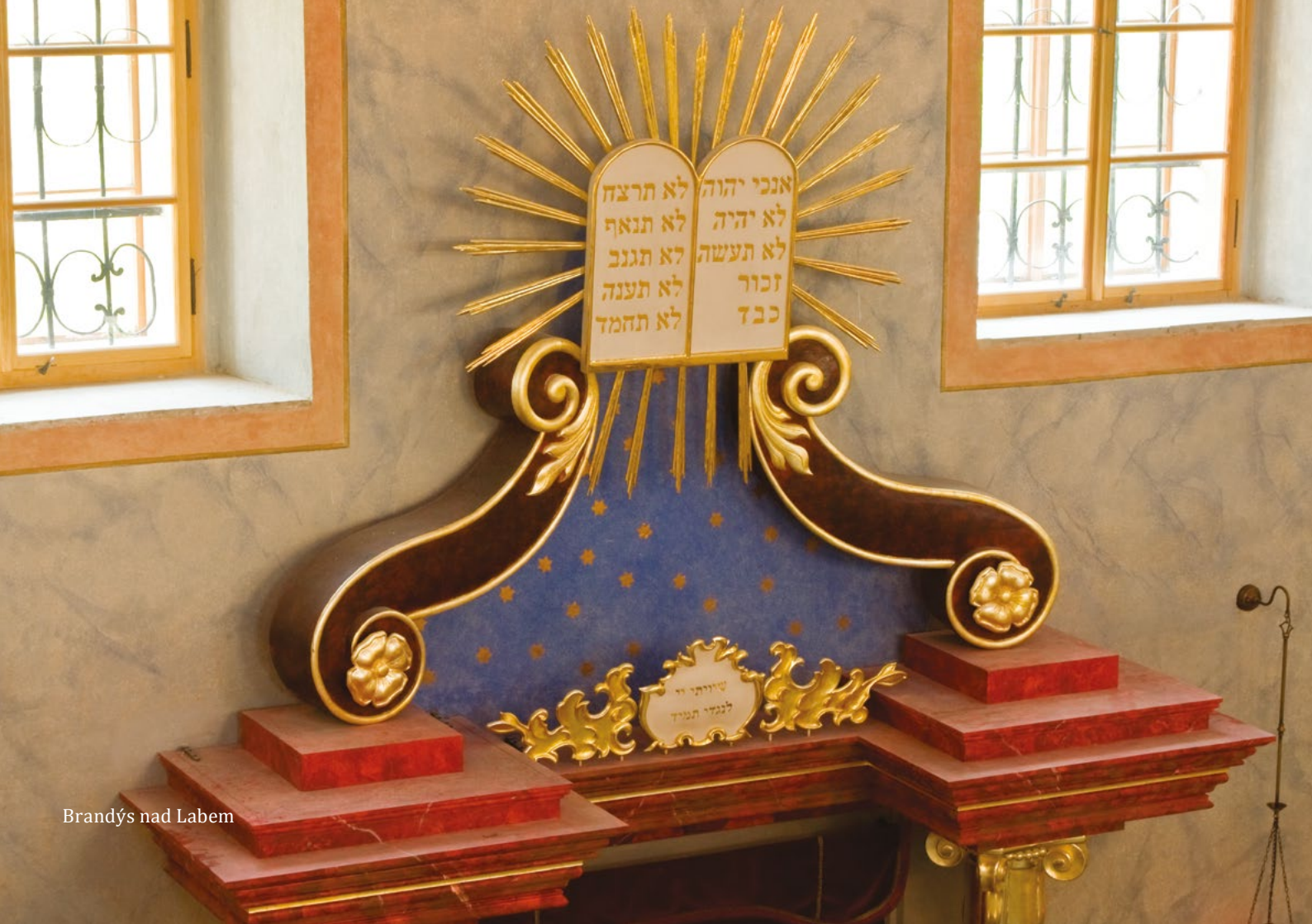
Brandýs nad Labem